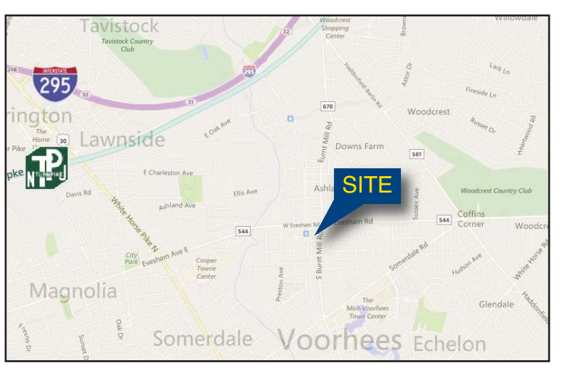
ALL INFORMATION FURNISHED REGARDING PROPERTY FOR SALE, RENTAL OR FINANCING IS FROM SOURCES DEEMED RELIABLE, BUT NO WARRANTY OR REPRESENTATION IS MADE AS TO THE ACCURACY THEREOF AND SAME IS SUBMITTED SUBJECT TO ERRORS, OMMISSIONS, CHANGE OF PRICE, RENTAL OR OTHER CONDITIONS, PRIOR SALE, LEASE OR FINANCING OR WITHDRAWAL WITHOUT NOTICE. NO LIABILITY OF ANY KIND IS TO BE IMPOSED ON THE BROKER HEREIN.

651 Route 73 North, Suite 111 • Marlton, NJ 08053 • Phone: (856) 985-9522 • Fax: (856) 985-9488