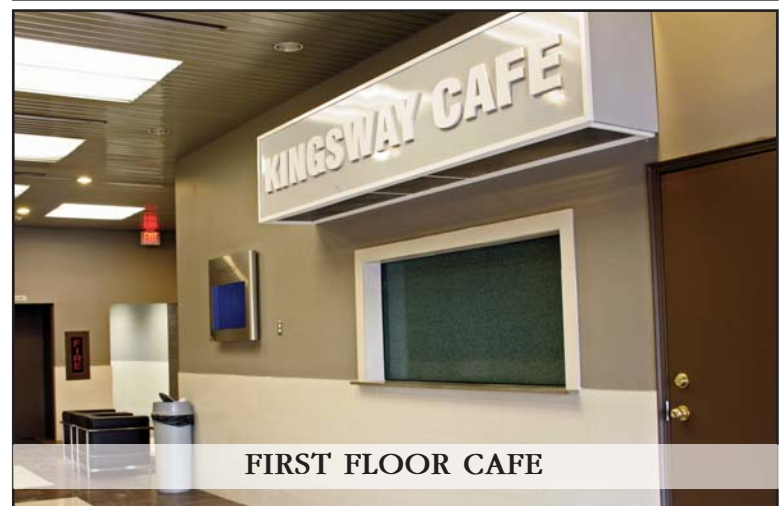
FIRST FLOOR CAFE

651 Route 73 North, Suite 111 • Marlton, NJ 08053 • Phone: (856) 985-9522 • Fax: (856) 985-9488