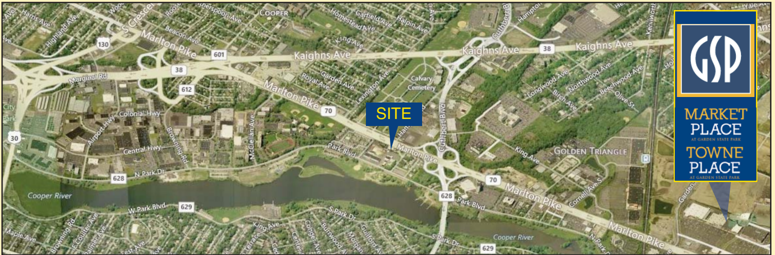
NJ Route 70 (Marilton Pike)