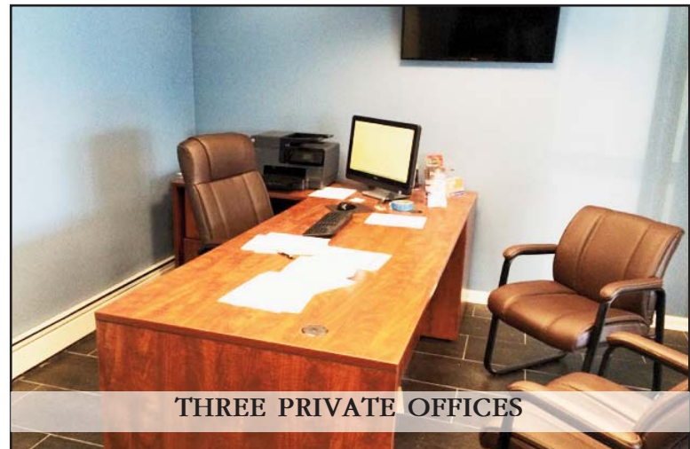
THREE PRIVATE OFFICES