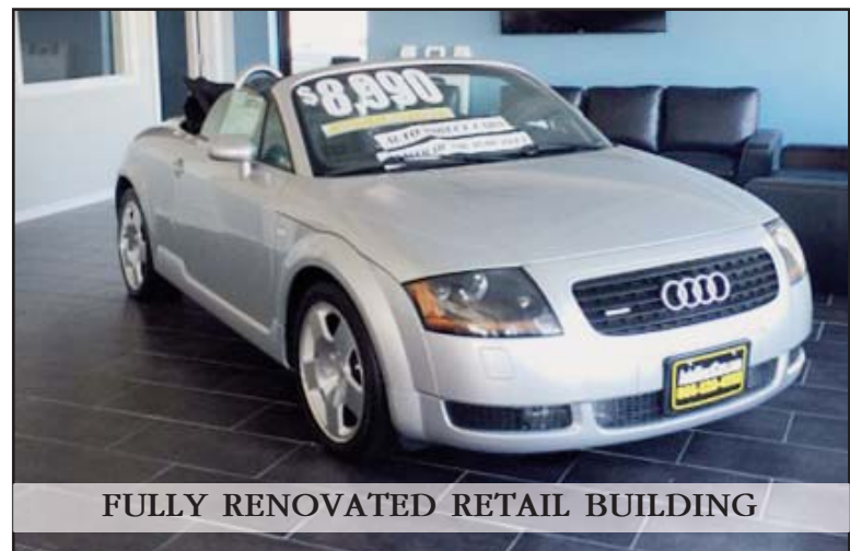
FULLY RENOVATED RETAIL BUILDING

651 Route 73 North, Suite 111 • Marlton, NJ 08053 • Phone: (856) 985-9522 • Fax: (856) 985-9488