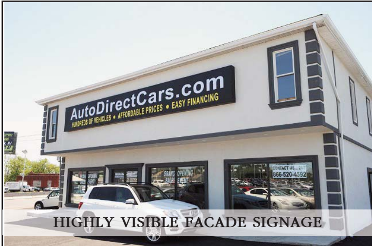
HIGHLY VISIBLE FACADE SIGNAGE