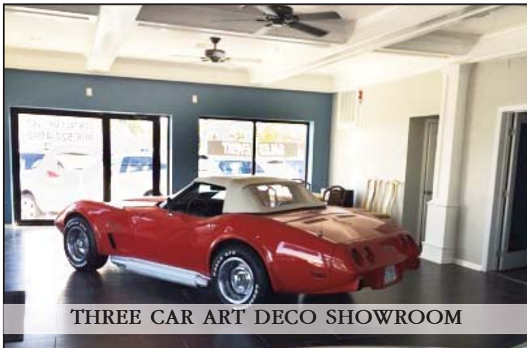
THREE CAR ART DECO SHOWROOM