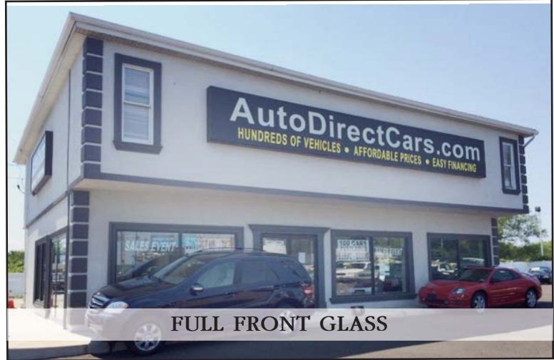
FULL FRONT GLASS