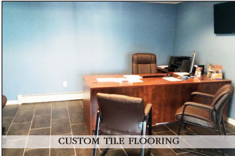
CUSTOM TILE FLOORING