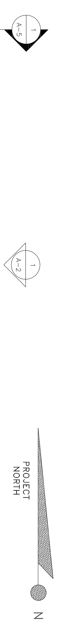
1 FLOOR PLAN A-1 SCALE: 1/4" = 1'-0"