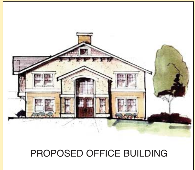
PROPOSED OFFICE BUILDING

For Further Information, Please Contact: