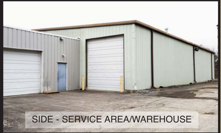
SIDE - SERVICE AREA/WAREHOUSE