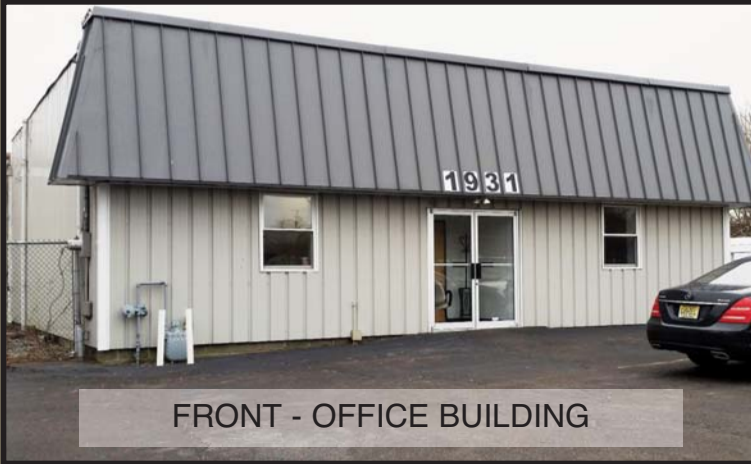
FRONT - OFFICE BUILDING