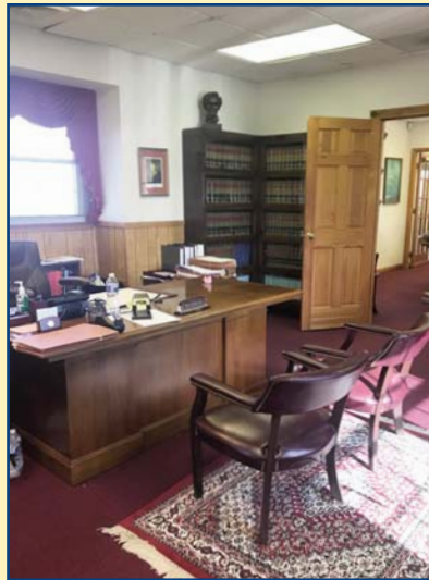
Executive Office 2nd Floor With French Door Entry