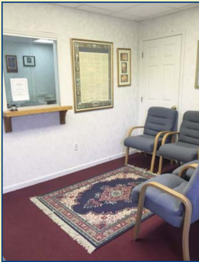
Reception / Waiting Room