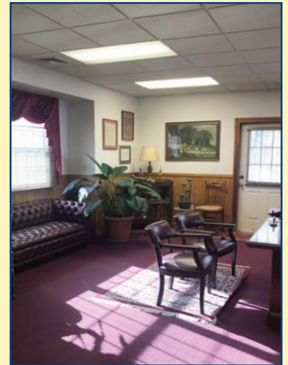
Executive Office 2nd Floor Private Rear Entry